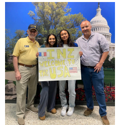
Inz ~ from France, hosted by the Crystal City Pentagon Club